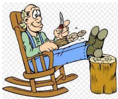
Alwyn at home?