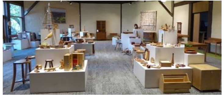
View of our 2018 exhibition

In addition to the volunteers receiving exhibits, we will also need 3-4 volunteers bring up the freshly painted plinths from the storage room beneath the reception centre and also a similar number to return them on Sunday after the close of the exhibit.